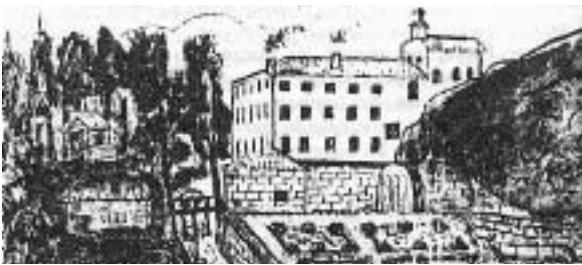
The need for more accommodation. A drawing of an early stage of the Hermitage building - Fr Bourdin’s sketch.

‘ To replace him there is need of a man such as you have