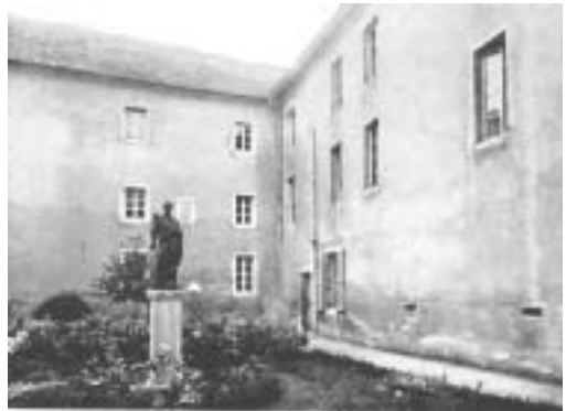
Inner courtyard of la Capucinière, Belley.