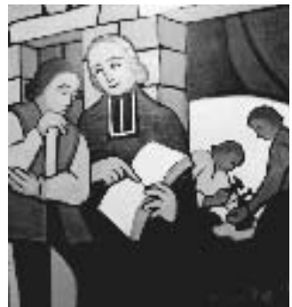
Learning to read, learning to make nails - education and manual work.