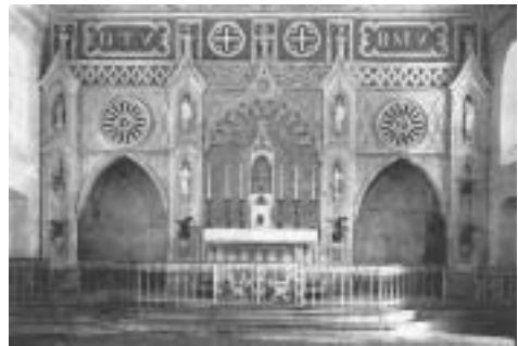
Chapel of La Capucinière, Belley, where the first Marist priests professed their vows.

Shortly afterwards, on the invitation of the Master of Ceremonies, Father Champagnat 22 , addressing himself to the newly elected, said what a burden had been imposed on him (Colin) and promised, in the name of all his confreres, that he would strive to lighten the weight of it for him.