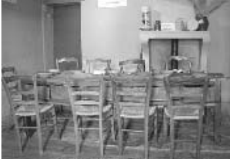
Champagnat's handiwork - table and cupboard in the Brothers' house at La Valla.