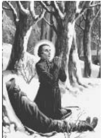
A near diaster. Champagnat and Brother Stanislas lost in the snow, 1823.

Placed by their Founder in a position of