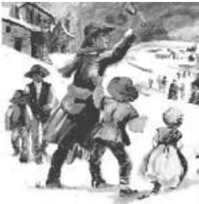
Brother Catechist in the hamlets.

'The upshot of this episode was that the teacher quit the field. Champagnat's Brothers were then unchallenged in the small town of La Valla.