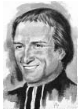
Saint Marcellin Champagnat (1789-1840).