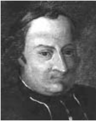
Fr Coindre. Showing good common sense, he resisted Fr Cattet's attempt to join Champagnat's congregation to his.

(Quoted from 'Origines Maristes' Vol. I Doc. 218.)