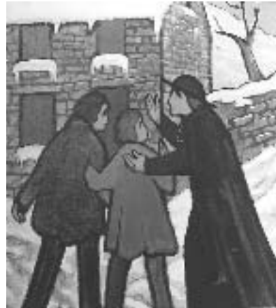
The beginning, 2 January 1817. The first two Brothers enter the 'Cradle of the Institute' at La Valla.

"My status as a priest does not prevent me from owning property. You may not want me here as curate, but to live in a house in La Valla is my privilege. I shall enjoy the use