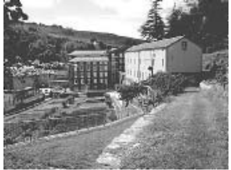
Notre Dame de l'Hermitage, a recent view.

Illustrations for the following passages are taken from the four volumes of 'Origines Maristes'