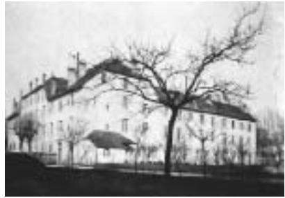
A view of the Capuchinière from the garden. The election of the Superior general was held in this building.

administration! Your position of dignity raises you up only to expose you to the winds and storms, and, on the last day, you will answer for each of us.' Oh, with what fervour of heart we undertook the promise Champagnat made, in his own name and in the name of his colleagues, to do everything to lighten the burden, the very thought of which is alone sufficient to overwhelm.