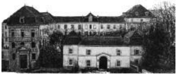
Retreat House. Minor seminary, Belley.

This is a most interesting picture of Champagnat - a humble man, yes, but also a man who, before people in high authority or before intellectuals, seems to be hesitant and lacking in confidence. This is much