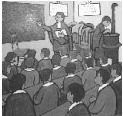
Initial classes - Brother Teacher and Brother Cook. Boys' attention is somewhat divided.