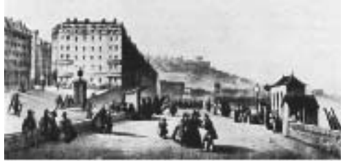
Wharf at Lyon.

One day Father Champagnat was coming back from a journey with another priest. 24 They stopped at the major seminary at Lyon, which was quite close to the disembarcation wharf of the steam boat. His companion wanted to leave his small travel bag so that he would not have to traverse the town with it. He would then send a Brother