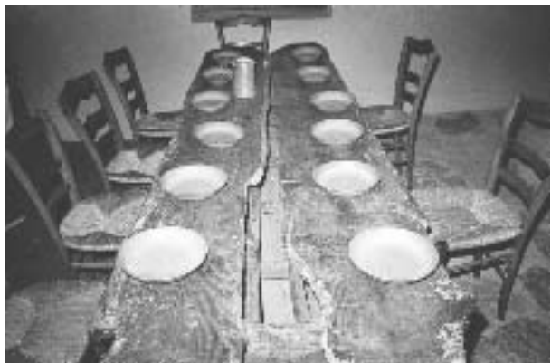
The dining-room at La Valla.

I report these words in order to make known the humility of Father Champagnat, but it is sufficient to cast a eye over these recollections in order to see that they have no foundation other than the modesty of this saintly confrère.