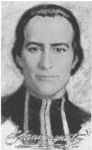
Saint Marcellin Champagnat

(Quoted from 'Origines Maristes' Vol. I Doc. 416 p.951.)