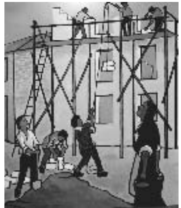
Coming of the eight Postulants necessitates building extensions at La Valla, 1822.

So it seems clear that there was a period of understanding and collaboration