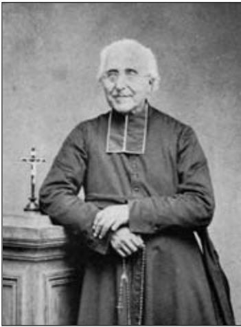
Father Jean-Claude Colin, founder of Marist priests and Sisters.

The establishing of Brothers at Saint-Antoine was one year before the Sisters, who went there in September 1827. They went from Rive-de-Gier to St Clair in mid-July 1827, where they joined those who had begun in 1816. 21 The situation at Saint-Antoine was better as far as the Marist Sisters were concerned, since, after having adopted the Statutes of the “Sisters of Notre Dame de Pradelles” (Haute-Loire), they found themselves authorised by the Royal Ordinance of 21 December 1828.