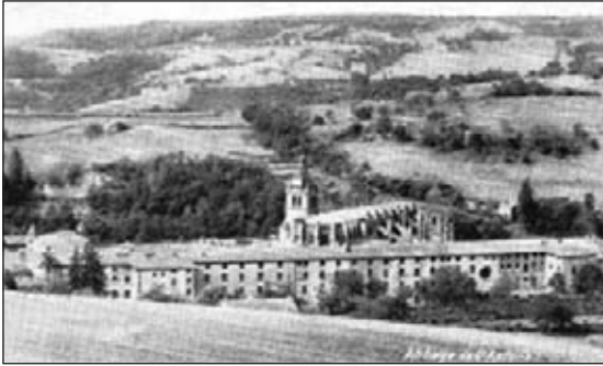
Abbey of Saint-Antoine. The Sisters’ part is to the right of the wheel-window.