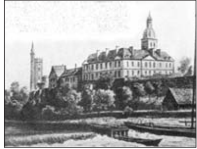
The abbey of Solesmes in the time of dom Guéranger.

state of prayer, in which, in His infinite goodness, He has been pleased to place me for some time, and which, I am firmly convinced, is a true state of contemplation. He reveals himself to me in these precious moments in such a striking manner and makes Himself felt in my soul in such an ineffable way. I have never felt nor experienced anything like it before. On the other hand, He unfolds all my misery and makes me see so very clearly all my sins, my faults, and my innumerable imperfections, that my heart is broken with the most lively grief, so that I feel again such a great confusion about them that, if I could then do so, I would bury myself in the centre of the earth to hide from all creatures - so much do I see myself as being deformed, horrible, abominable. ... Oh, in those moments, how willingly and wholeheartedly would I leave my life, nay, give a million lives, in order never to have offended the good God.” 50