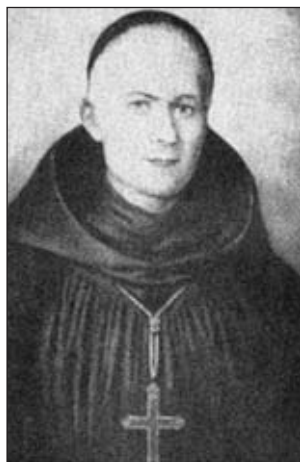
Dom Guéranger, Benedictine monk, Abbot of Solesmes.