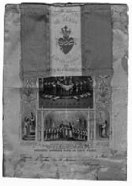
Flag of the Sacred Heart of Jesus

This image, distributed without doubt to the soldiers in transit through Paray-le-Monial, is typical of the Catholic sensibility amalgamating