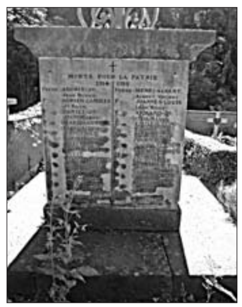
Brothers of the Province of l'Hermitage who died during WWI.

other by that of the province of Constantinople penetrating into Bulgaria, Hungary, Greece, while the province of Syria was beginning to be solidly established in Lebanon-Syria, Iraq (Bagdad), Egypt and Palestine. The History of the Institute of 1947 already gives an idea of the difficulties during the war: dissolution of the juniorate of Orsova in Hungary; in Serbia, the Brothers of Monastir taking refuge in Greece. Finally, the Brothers of Greece forced for a time to take refuge in Grugliasco. The collapse of the Austro-Hungarian and Ottoman Empires was going to make it very difficult for any resumation of expansion in this zone. It remains true, however, that the effect of the war on the whole of the Institute in the short term, was relatively limited and not without positive aspects. Whence the temptation to consider this conflict as a parenthesis, while it accelerated a worldwide secularisation of States and societies and limited the