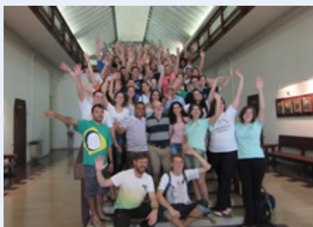
Young people form Brazil in Rome