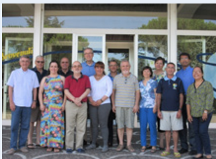
Rome International Commission ChMMF