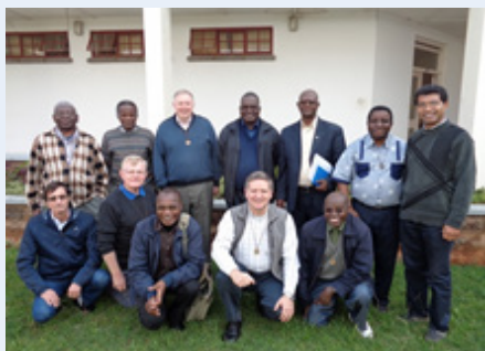
Nairobi: MIC-MIUC Budget Meeting