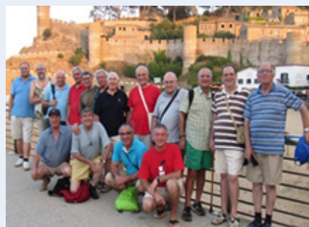
Brothers of the Province Compostela