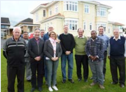
New Zealand: The Oceania Regional Council and the College of Leaders