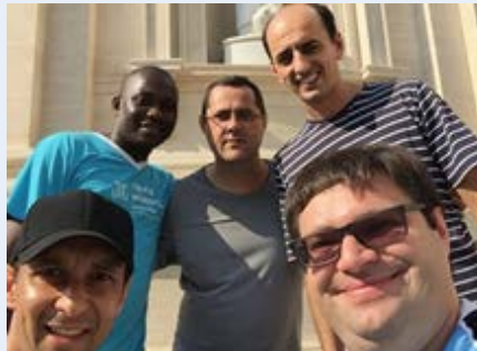
Vatican Brothers of the Course Gier