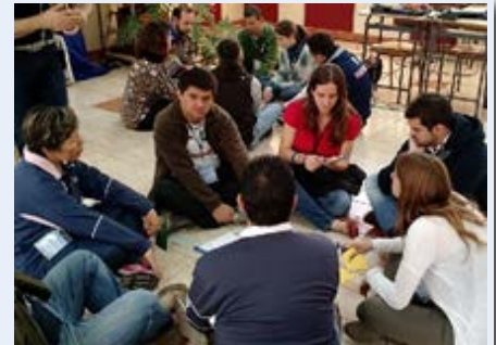
Peru: Marist Inter-American Meeting of Co-ordinators of Evangelization