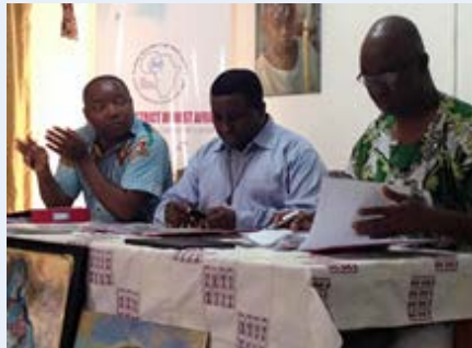
Ghana Chapter of the District West Africa