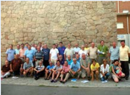
El Escorial Red de Comunidades de Europa marista