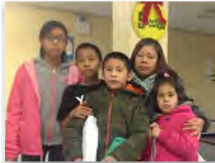
United States (New York): Christmas celebration of Comunidad Juan Diego