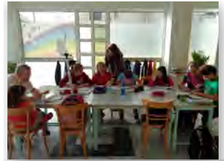
Greece: Social Center Acharnès