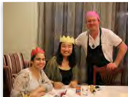
Australia: Sydney Marist Youth Ministry