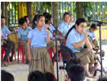
Cambodia: LaValla School