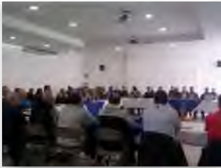
Mexico: Provincial Chapter of México Occidental