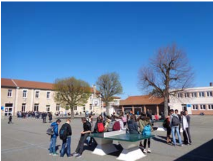
France: Collège Mariste à Chazelles-sur-Lyon