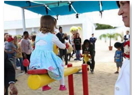
Portugal: Casa da Criança centre in Tires