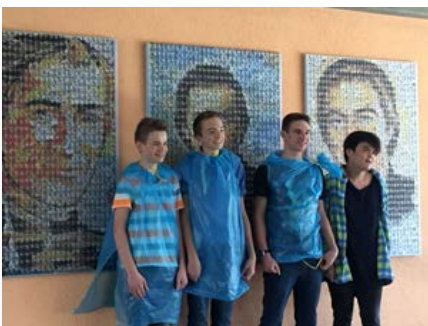
Germany: Youth Meeting, Maristen Realschule Cham