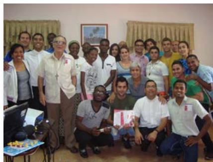
Cuba: National Youth Commission with students