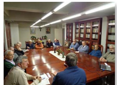
Spain: Mataró community of Catalonia in L'Hermitage Province