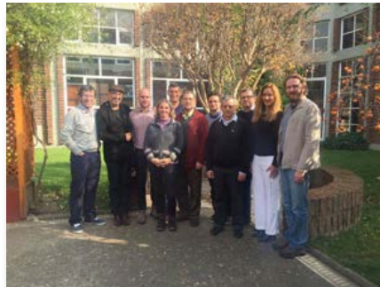
Chile: First meeting of the implementation team of the Region América Sur