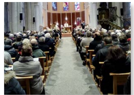
La Valla, France

The first group was housed for about three months in the San José house, until a first evaluation of the process. From the start, the Uruguayan government provided for the integration of all migrants into the local education system, at the corresponding levels, and provided for permanent accommodation for each family, as well as work solutions for adults.