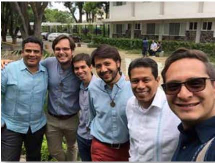
Mexico: Zapopan, Jalisco