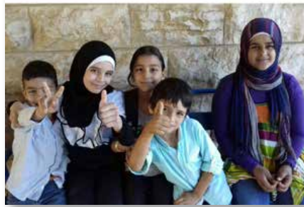
Lebanon: Fratelli Project