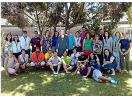
General House: Accompaniment Course for Marists of Europe