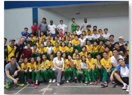
Philippines: MAPAC Coaching module