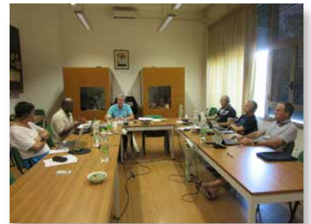
General House: International Commission for the Revision of the Constitutions