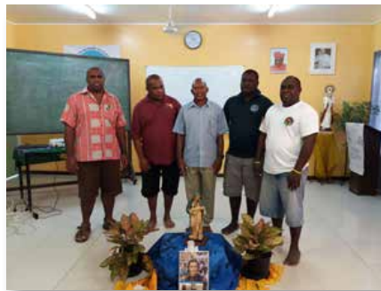
Papua New Guinea: District Council of Melanesia