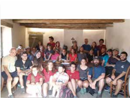
France: Marist young people from Canada in La Vallá