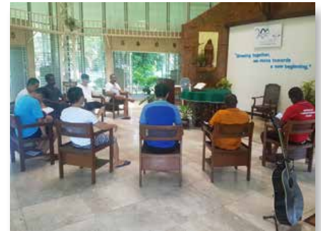
Philippines: MAPAC (Marist Asia-Pacific Center)