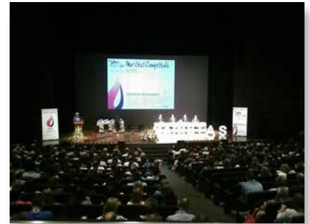
Spain: Meeting of educators, Province of Compostela