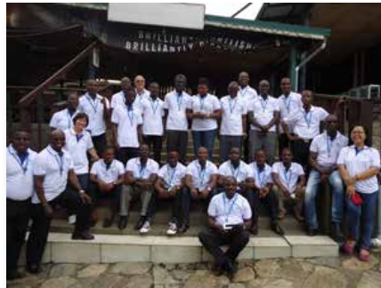
Ghana: Workshops with Marist laity