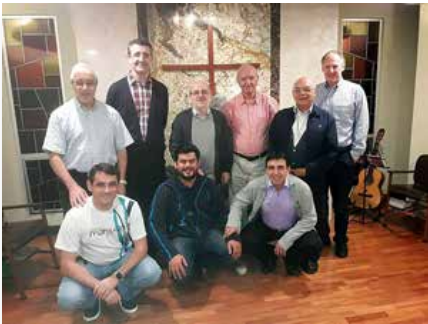
Guatemala: Community of the Provincial Residence of América Central