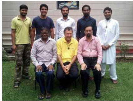
Sri Lanka: retreat for Brothers of Sri Lanka and Pakistan, Ampitiya (Kandy)