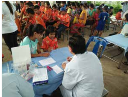
Thailand: Bangkok gives medical services at Marist Centre for Migrants, Samut Sakhon