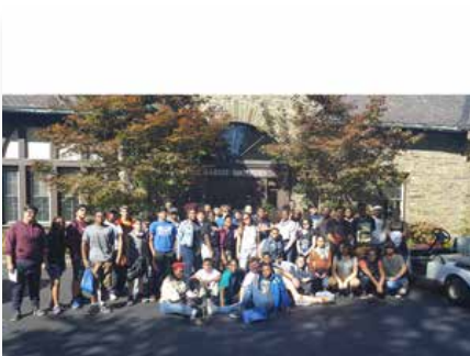
United States: Annual 'Community Day' of Marist High School, Bayonne (NJ)