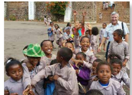
Ivory Coast: St Marcellin Champagnat School, Bouaké

government will not be overthrown by arms as they thought and desired and that a political solution can only exist by keeping the president, broadly supported by the population, the Syrian army and the Russian ally. Hence, the various statements of the leaders of the western world indicating that their priority is to fight Daech and terrorism- which the Syrian government has been repeating for six years- not the fall of the regime.