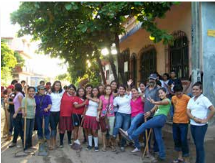
Mexico: Marists of Bachillerato "Asunción Ixtaltepec", Ixtaltepec