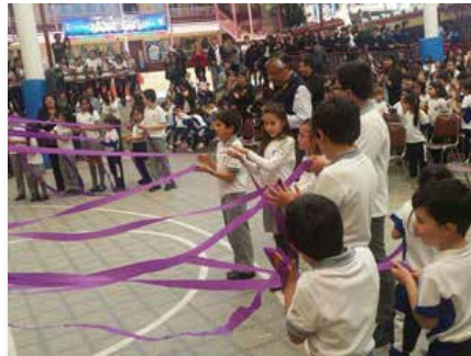
Chile: Colegio Champagnat - Colegio Marista, Villa Alemana