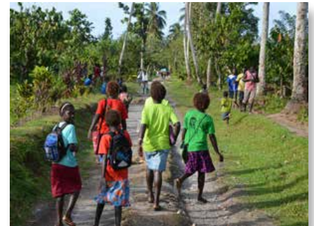
Papua New Guinea: St Joseph's College, Mabiri - Bougainville Island