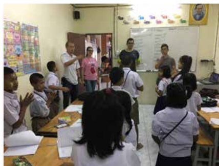
Thailand: Marist Centre for Migrants, Samut Sakhon