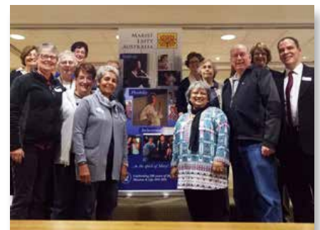
Australia: Marist Laity Reflection Day, Sydney