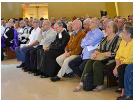
United States: Marists from Cuba celebrate the bicentenary, Miami