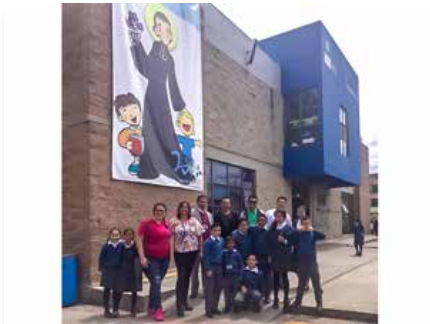
Colombia: Presenting Marist vocation at two schools, Bogotá