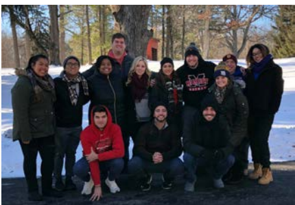
United States: The Marist Young Adult Advisory Committee