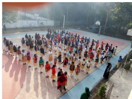
Bangladesh: St. Marcellin School, Giasnoger