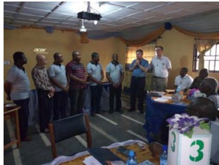
Nigeria: Provincial Chapter, Orlu