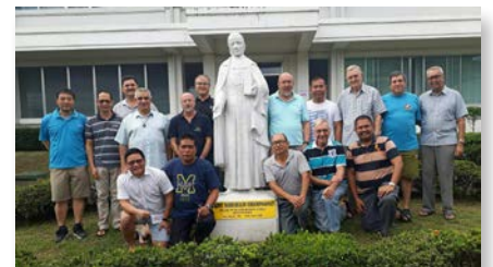
Philippines: Marist Formators from the Asia Region gathered at MAPAC