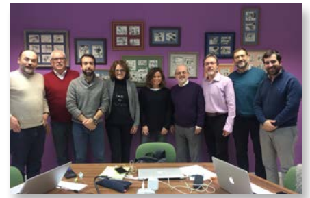
Spain: Network of marist communication teams in Spain