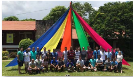
Paraguay: Meeting of young brothers from América Sur, Coronel Oviedo