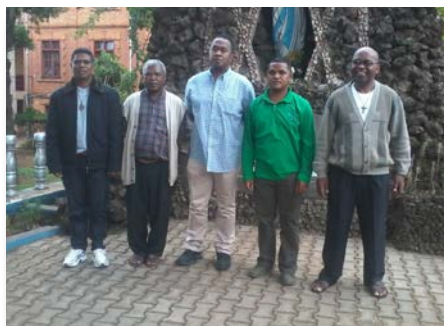
Madagascar: New superior and provincial councillors