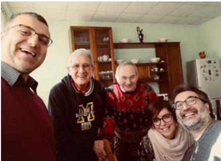
Italy: Community of Giugliano