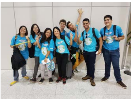
Brazil: Marist students going to Oceania