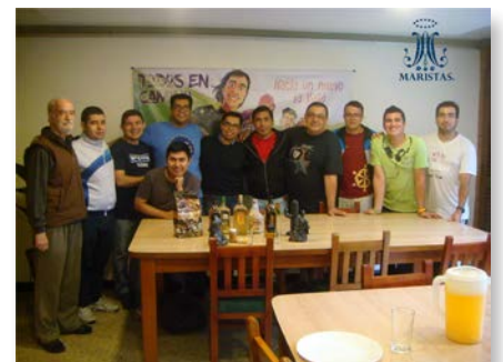
Colombia: Marist novitiate La Valla, Medellín