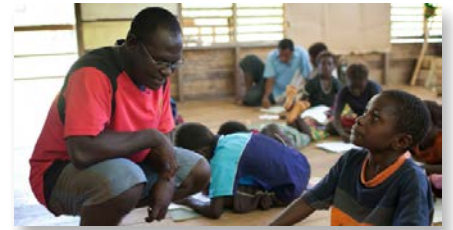
Papua New Guinea: St Joseph's College, Mabiri