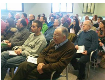
Spain: Ibérica prov discusses the life of young people in today's world, Lardero