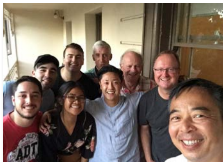
Australia: Australian Marist Youth Ministry leaders celebrating Australia Day in Melbourne