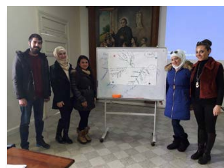
Syria: Workshop on life skills with the Blue Marists, Aleppo