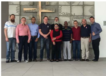
Brazil: Meeting of Africa and Asia's technical team of sustainability, Curitiba