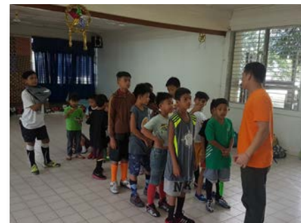
Philippines: MAPAC, Marikina City