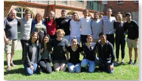
Australia: National team of the Marist Youth Ministry