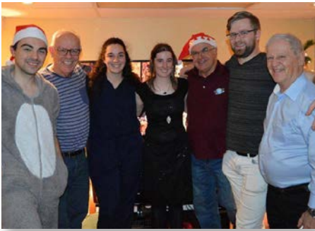
Canada Maison Mariste de Sherbrooke