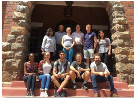
South Africa: Volunteers of Three2six project, Johannesburg