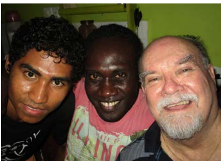
Sri Lanka Novitiate of Tudella