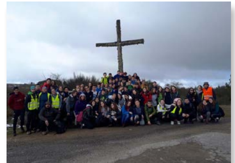
Spain: The Way of Saint James, Compostela Province