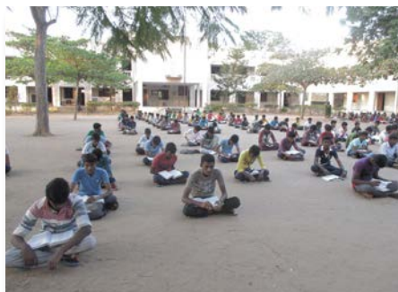
India St. Marcellin School, Mangamanuthu