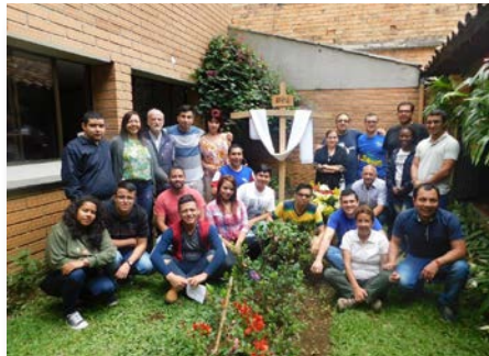
Colombia: Easter in Medellín, with Brothers and lay people