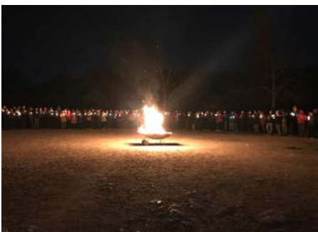
Spain Pasqua de les Avellanes