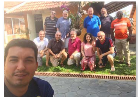
Cambodia: Formators & Cmi directors visit a Lavalla200> members, Phnom Penh