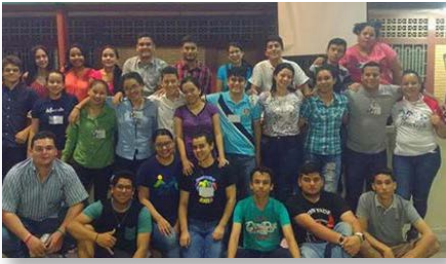
Nicaragua Easter with Remar, Estelí