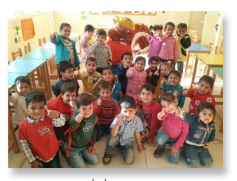
Lebanon Fratelli Project, Rmeileh