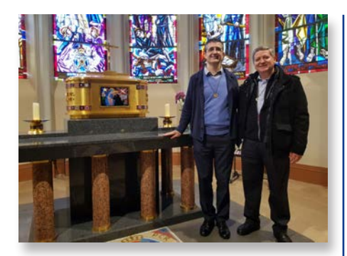
France: Brothers Superior General and Vicar General in l'Hermitage