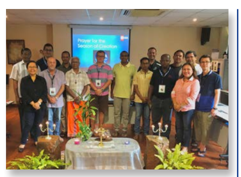
Singapore: Meeting of the Commissions of Spirituality, Laity and Mission for Asia