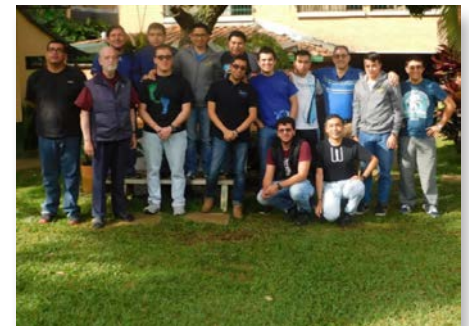
Colombia: Enneagram Workshop at the Noviciado Interprovincial La Valla - Medellín