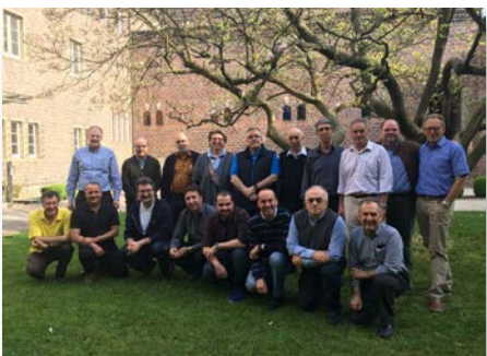
Germany: CEM meeting with European Marist life and mission teams - Freising