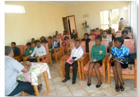
Madagascar: Retreat of youths and lay Marists - Antsirabe