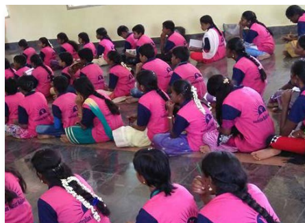
India: Summer camp at Marcellin Trust Centre - Tiruchirappalli