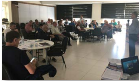
Brazil: Provincial assembly of Brasil Centro-Sul in Curitiba