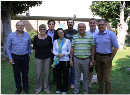
General House: International Council for Economic Affairs, Rome