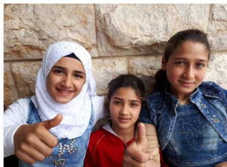
Lebanon Fratelli Project, Rmeileh