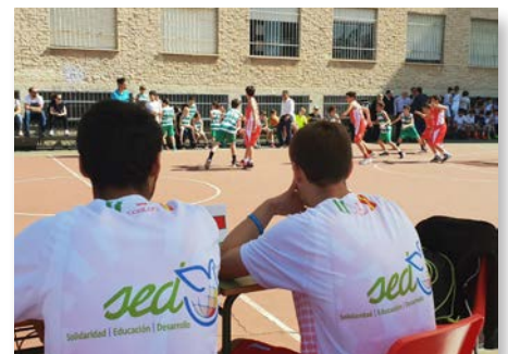
Spain: Maristiada 2018 at Cervantes School - Cordova