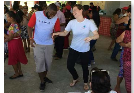
Brazil Tabatinga: Lavalla200>