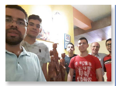
El Salvador: Marist aspirants in the community of Santa Tecla