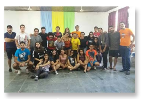
Paraguay Meeting of leaders of the Marist Youth