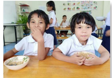
Thailand Marist Centre for Migrants, Samut Sakhon