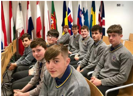
Ireland: Marist leaders and Transition Year students - Dublin