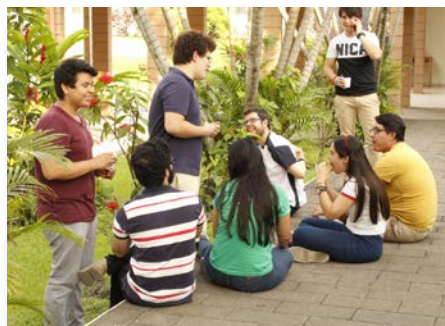
El Salvador Leaders course