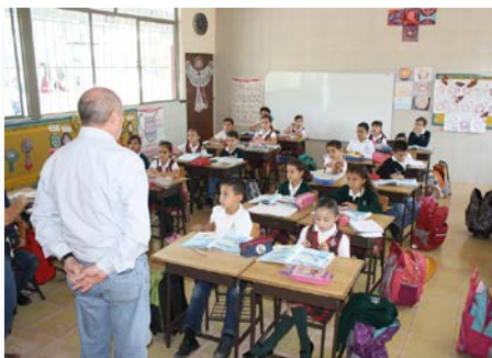
Mexico: Provincial's visit to the Colegio Marista Primaria - Aguascalientes