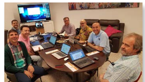
Spain Delegates of Provinces with works in Spain