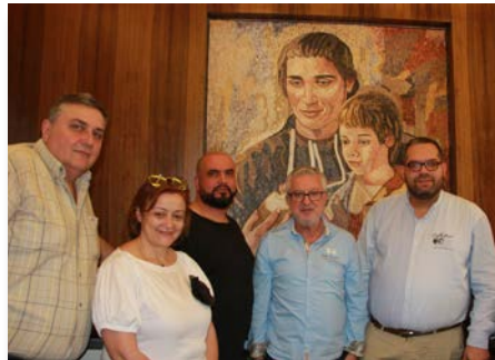
Lebanon Champville - New mosaic of St. Marcellin