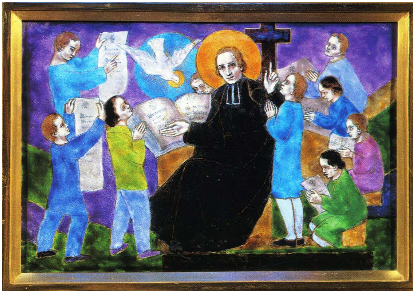
Image in the reliquary of Saint Marcellin in l'Hermitage

They are able to connect easily with each other and create relationships, although at times it would seem that they are afraid to deepen these relationships and make them lasting ones. They build networks of solidarity with ease and are capable of altruistic actions, having to fight against everything that leads them to focus too much on themselves, on a society that favors self-centeredness and indifference; there are signs of thirst and openness to inner and spiritual experiences, even if they have diffi-