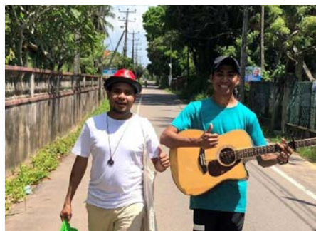
Sri Lanka Novices of the Asian Novitiate at Tudella