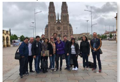
Argentina: Meeting of the Network of Marist Schools from the Region of América Sur, in Luján