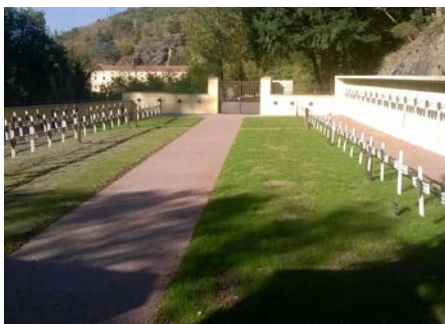
France Cemetery of Notre Dame de l'Hermitage