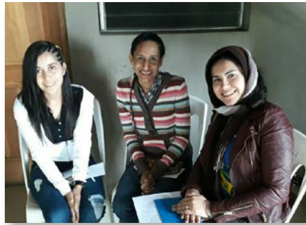
Nicaragua Meeting of Marist Fraternities