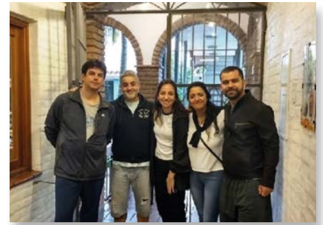
Uruguay: Communication team of the Province of Cruz del Sur