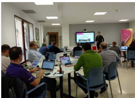
Spain: Assembly of Representatives of CME in Xaudaró