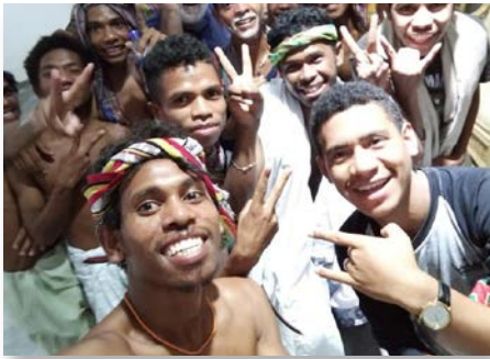
East Timor Marist vocational meeting