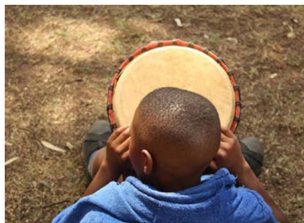
South Africa Three2Six Project