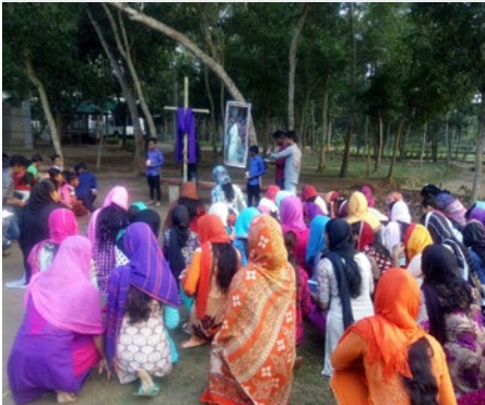
Bangladesh: Way of the Cross at Giasnagar St Marcellin school