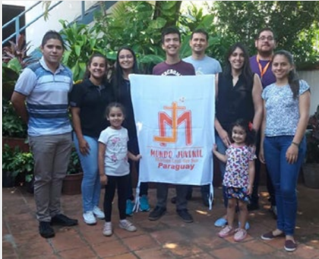
Paraguay: Meeting of local referents - Marist Youth World - Asunción