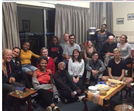
South Africa Marist Youth Supper - Johannesburg