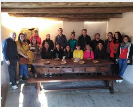
Belgium: Province of Western Central Europe in pilgrimages to L'Hermitage