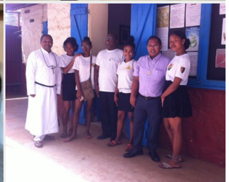
Madagascar: Celebration of Saint Joseph's Day at the St Joseph Antsirana Institution