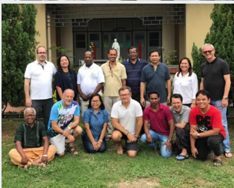
Malaysia: Meeting of the commissions of the Asia region in Port Dickson