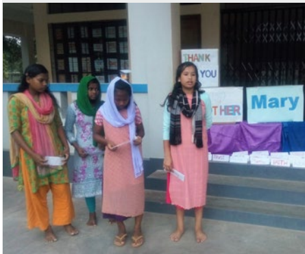
Thailand St Marcellin, Giasnogor