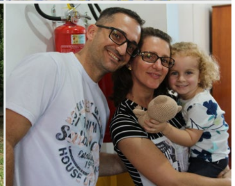
Brazil "Praça da Vida Marista" in Itapejara D'Oeste