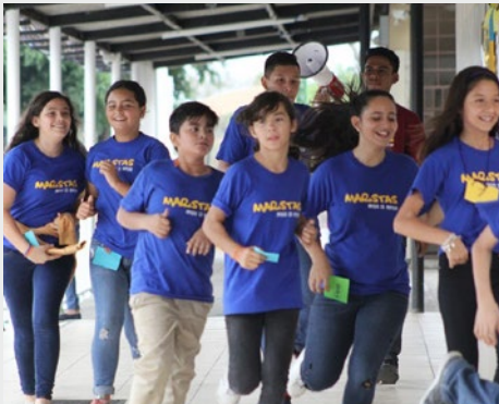
El Salvador Marist youth - Amigos en Marcha