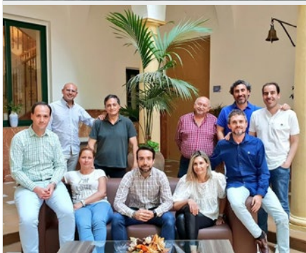
Spain Course for New Executives in Castillo de Maimón