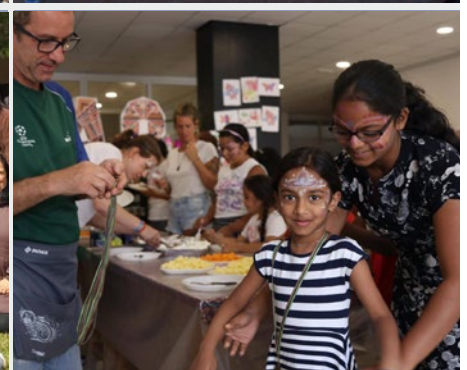
Italy Lavalla200> Siracusa

work with collectors of recyclable material, listening to the homeless, etc.).