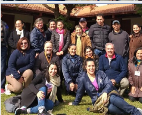
Paraguay Coronel Oviedo