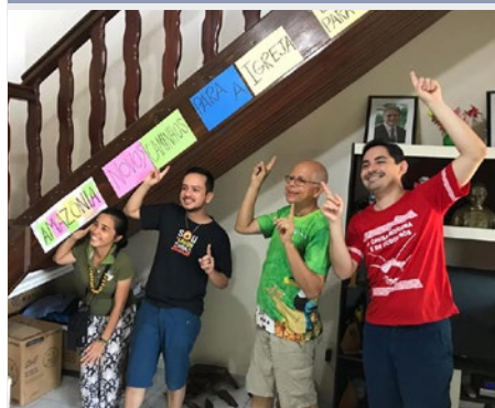
Brazil: Manaus: Meeting of Marist communities in the Amazon region