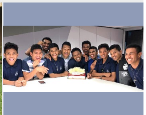
Australia Timor Leste Aspirants in Randwick