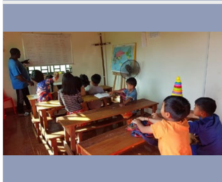
Cambodia Pulung community in the countryside