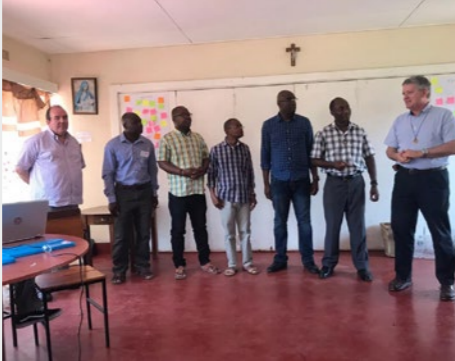
Malawi New Provincial Council of Southern Africa