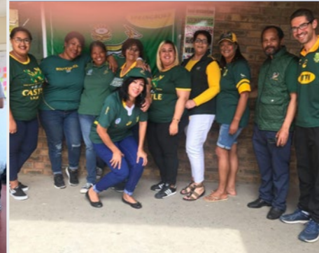
South Africa Lavalla200> Atlantis