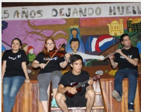
Paraguay Community «Animación Musical Marista»