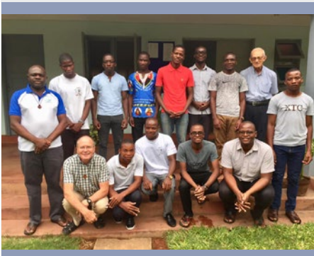
Mozambique Novitiate in Matola