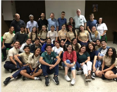
Venezuela Colegio de Nuestra Señora de Chiquinquirá