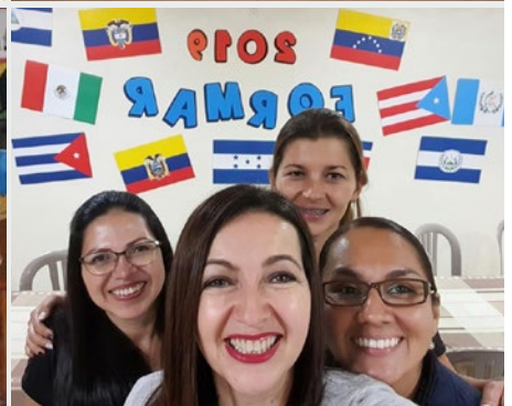
Guatemala Meeting FORMAR 2019