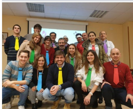
Spain Marist Educators Meeting in Alcalá