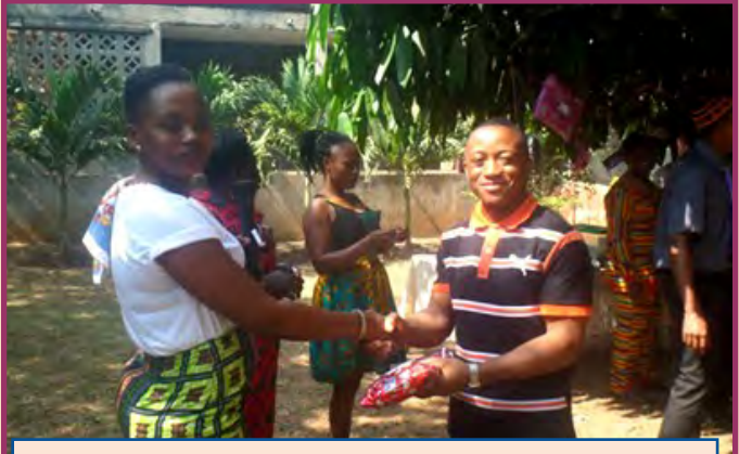
The Novitiate community presented gifts to all community members & co-workers.