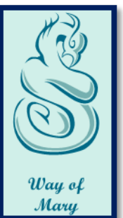
Way of Mary

There is a beauty about the shark that reminds us of determination and single mindedness when pursuing your goals. We lead children and young people towards taking responsibility for their actions and to taking steps that will lead to a life of self-fulfilment.