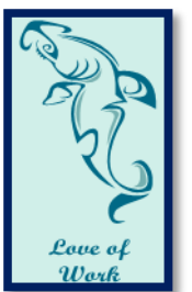
Love of Work

The turtle represents patience and endurance. There is warmth about the turtle that reflects in us a willingness to accept others as they are. We work to make children and young people happy and comfortable by inviting them into community and develop a sense of belonging.