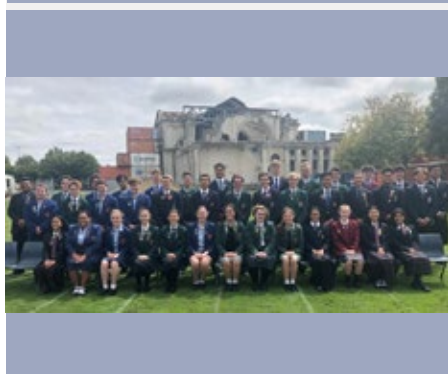
NEW ZEALAND: MEETING OF LEADERS OF MARIST SCHOOLS