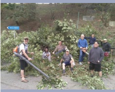
CLEANING THE GARDEN IN THE GENERAL HOUSE IN ROME