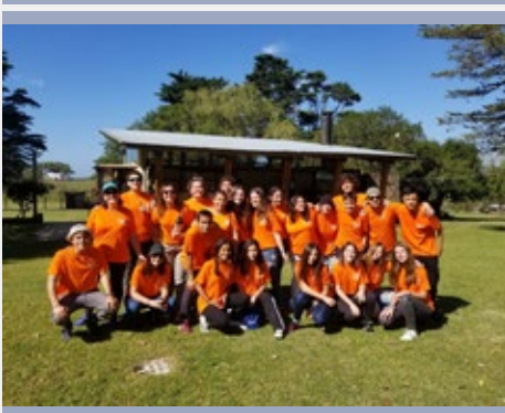
URUGUAY: 2020 FAMILY CAMP OF MARISTAS SAN LUIS SCHOOL , PANDO