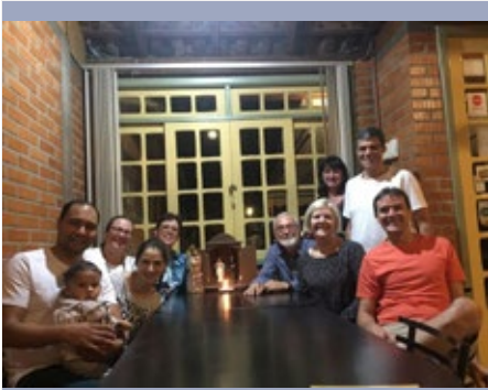
BRASIL: SAGRADA FAMÍLIA FRATERNITY OF CHAMPAGNAT MOVEMENT IN CURITIBA