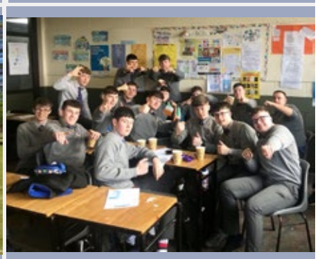
IRELAND: MARIST ATHLONE