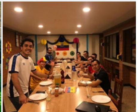
COLOMBIA: NOVITIATE OF "LA VALLA" IN MEDELLÍN