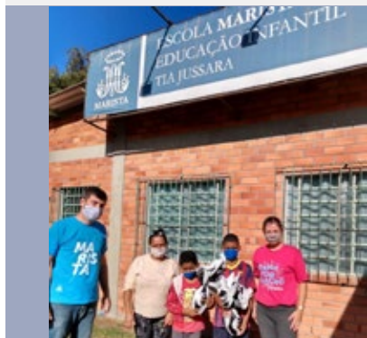
BRAZIL: DELIVERY OF DONATIONS TO STUDENTS OF THE MARIST SOCIAL CENTER APARECIDA DAS ÁGUAS