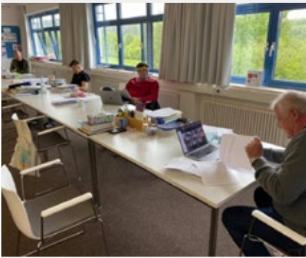
GERMANY: ONLINE CONFERENCE WITH THE ENTIRE MARISTEN-GYMNASIUM FURTH COLLEGE