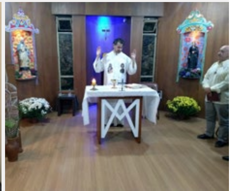
BRAZIL, BELO HORIZONTE