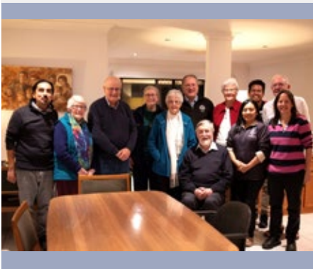
AUSTRALIA, MOUNT DRUITT