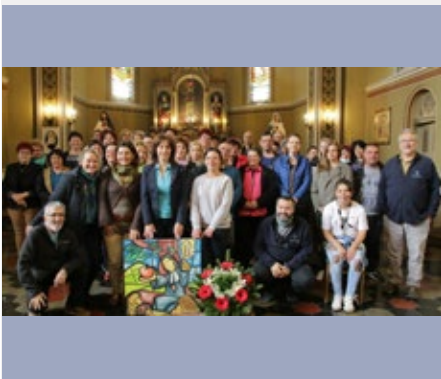
HUNGARY – KARCAG