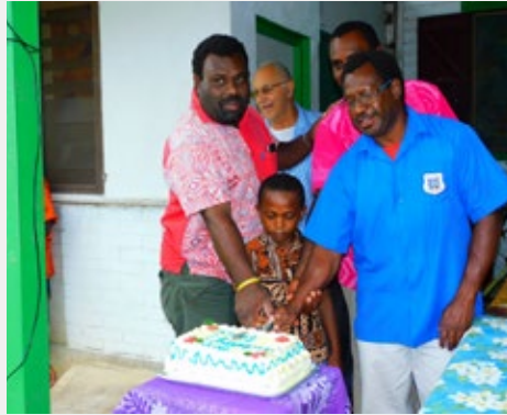
VANUATU – SANTO