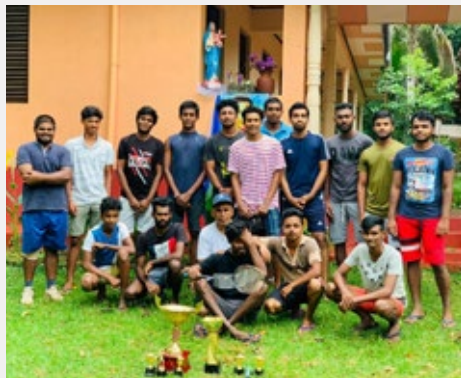
SRI LANKA, HALDANDUWANA