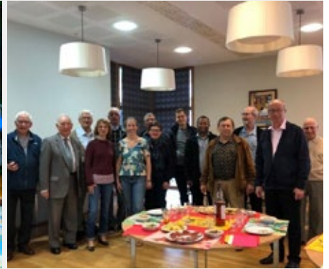
FRANCE – HERMITAGE