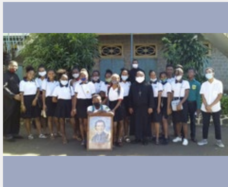
MADAGASCAR – ANTSIRANANA