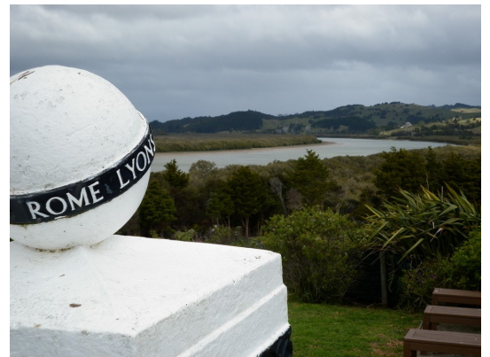
Totara Point showing the harbour where the Missionaries' boat arrived