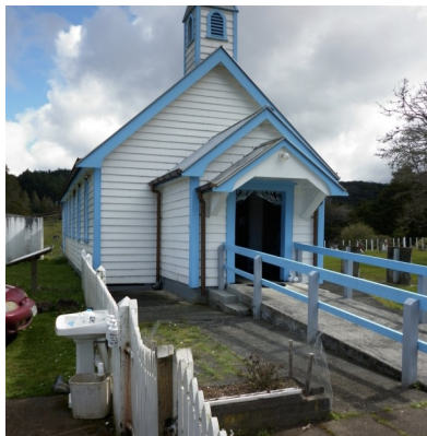
Bishop Pompallier's remains are interred under the altar at St Mary's, Motuti,