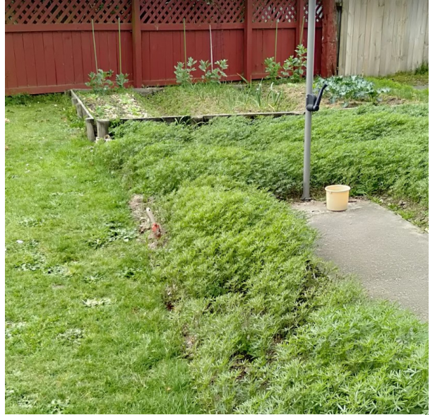
The back garden – lupins to prepare for spring planting