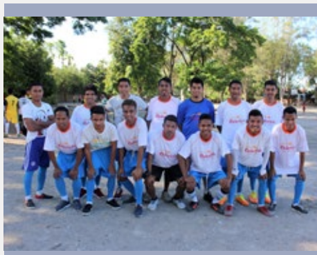
EAST TIMOR: YOUNG MARISTS