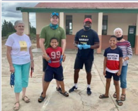
SOUTH AFRICA: MARIST MERCY CARE