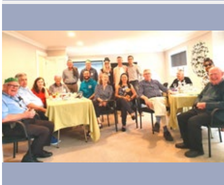
NEW ZEALAND. CHAMPAGNAT MARIST CENTRE