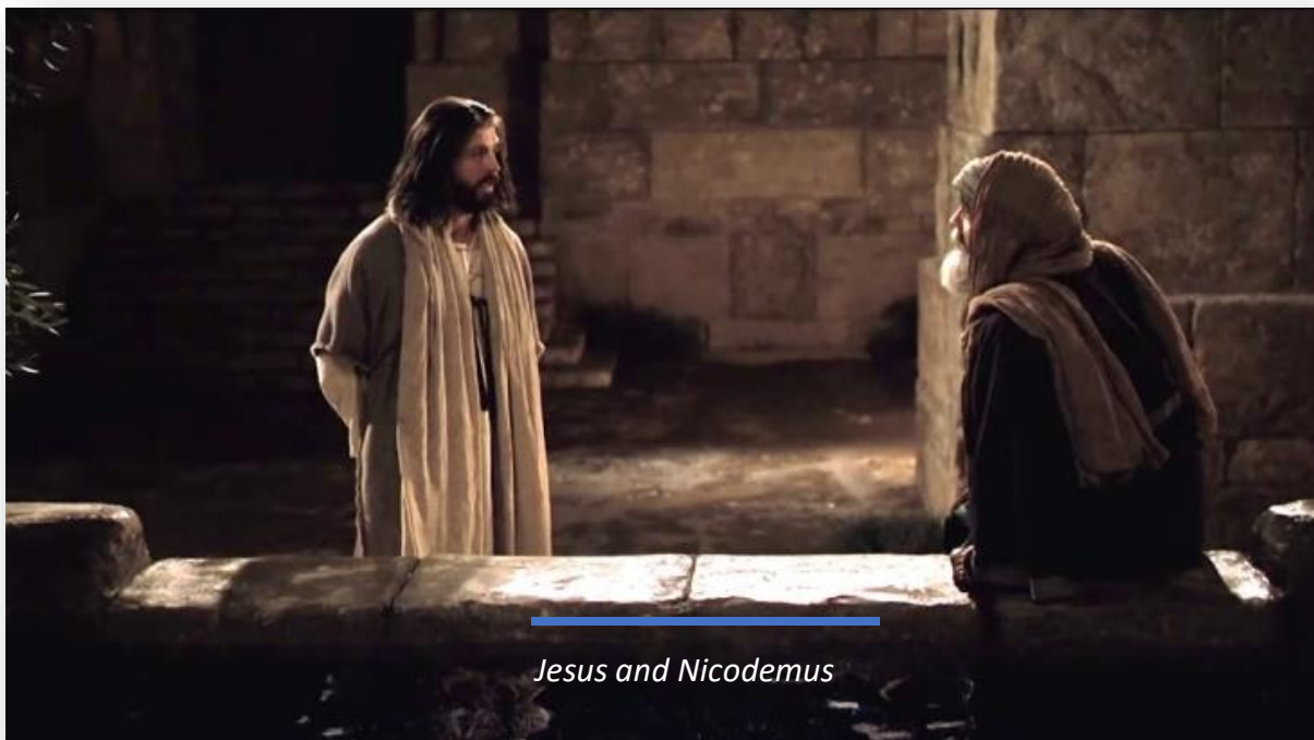
Jesus and Nicodemus

This Sunday is called "Laetare Sunday" in the Extraordinary Form of the Roman Rite since its mood and theme is one of hope and rejoicing that Easter is near. In the Ordinary Form this Sunday is not different from the other Sundays of Lent even though the entrance antiphon for the day still begins with the Latin word "laetare" and the vestments worn by the celebrant are rose colored, not violet. The day is important because it is the day of the second scrutiny in preparation for the baptism of adults at the Easter Vigil.