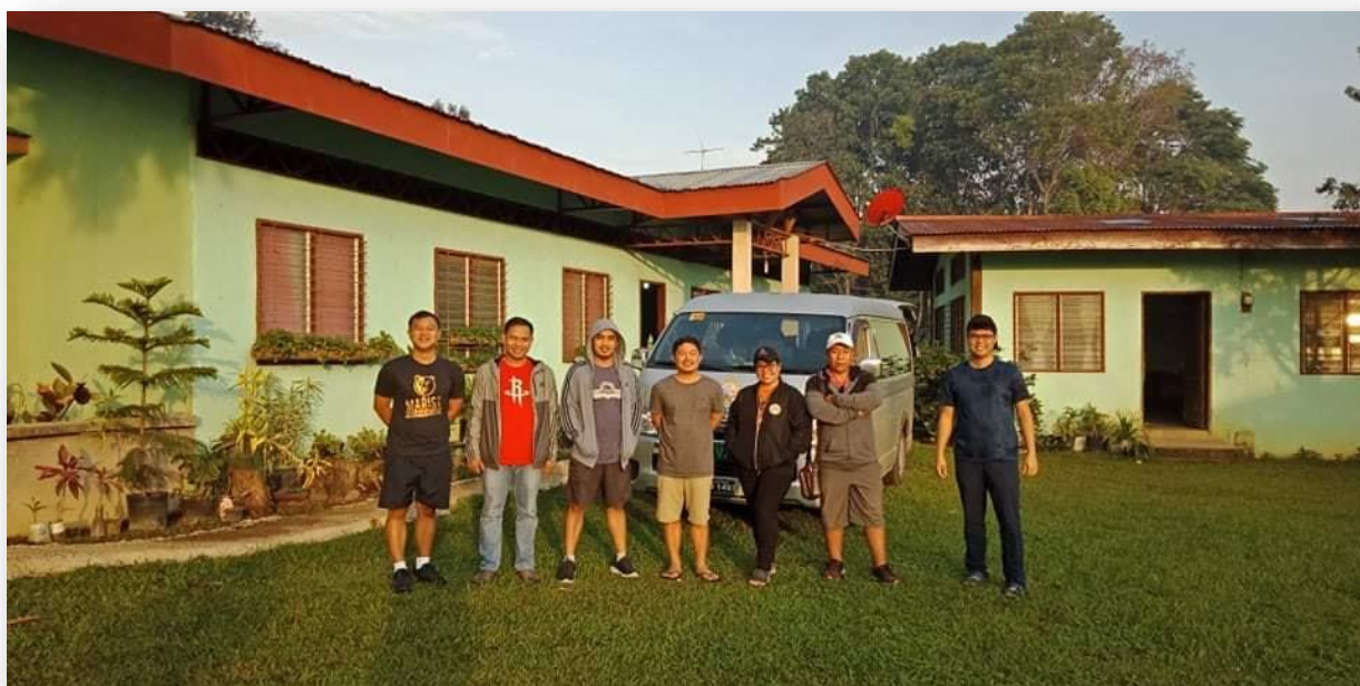
The Brothers and friends before leaving Bacusanon!