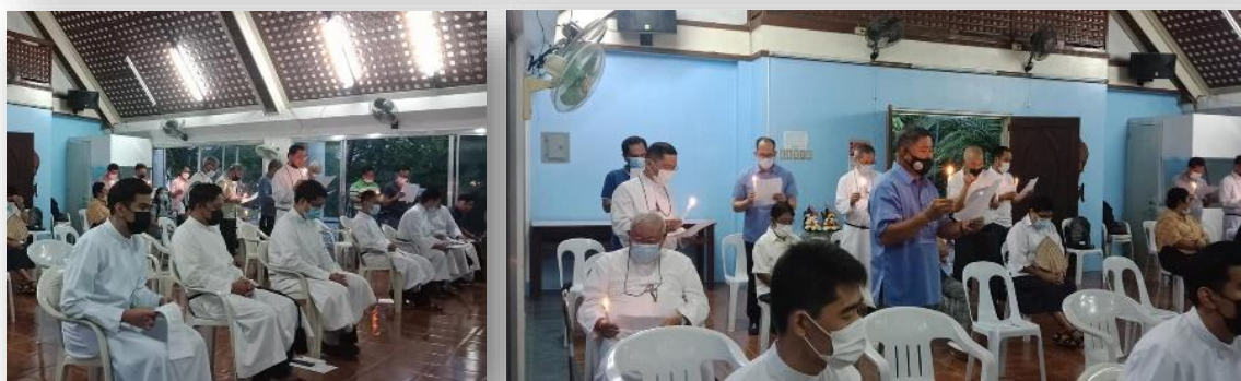
Perpetually Professed Brothers renewing their commitment.