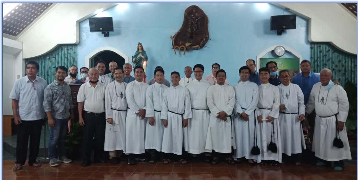
The Renewalists with all the Brothers who attended the celebration!