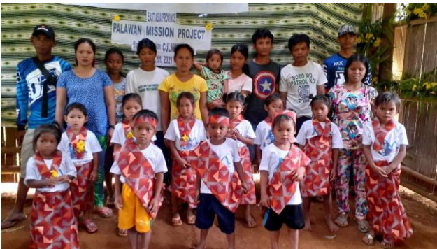
Graduating Pupils with their parents