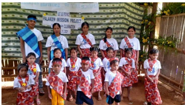
Graduating Pupils with their teachers