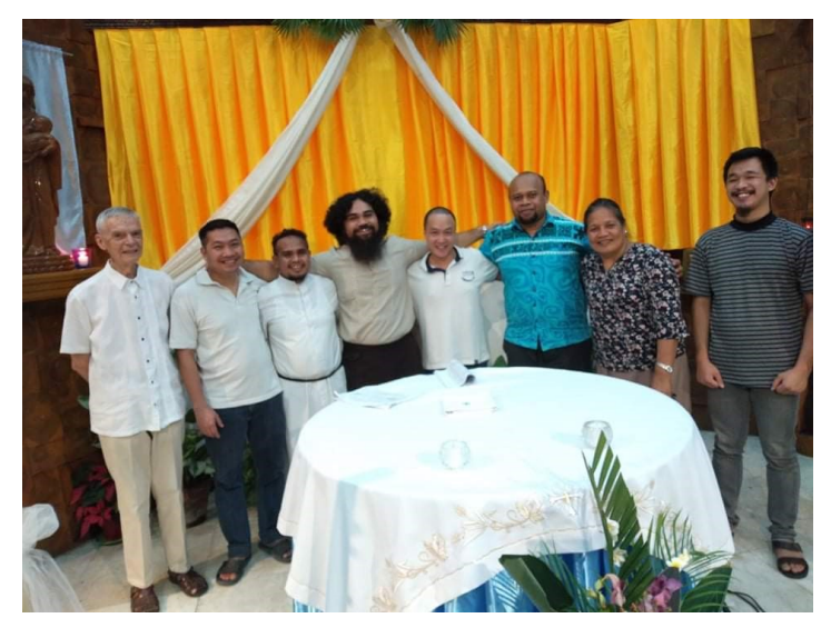
Mulivai Brothers gather with the Alafua community to Celebrate Easter