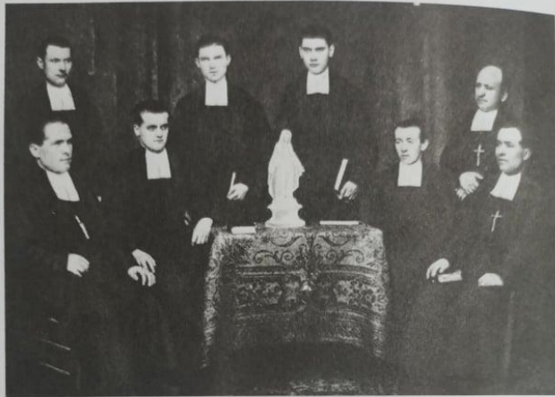
The Six Founders of the Marist China Province 8 March 1891, Marseille, France