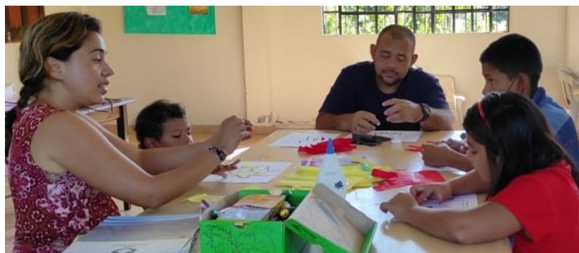
Catechism work at Xingu

Also, I played the guitar during Mass and it was not easy as I have to play Spanish and Portuguese hymns. The best thing was that the people enjoyed it and it helped them to sing and to participate during Mass .