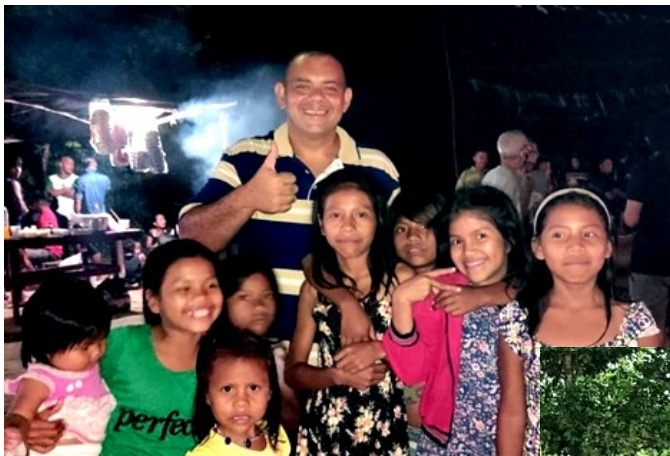
Photos with some indigenous people and children.