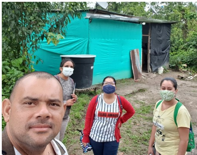
Visiting families at Xingu

With the arrival of these Missionaries we started visiting families and inviting them for Mass on Sundays, we supported the evangelization of the community, and also to get to know the reality of each of them regarding to their sacramental experience and together with them we plan and prepare for the sacraments