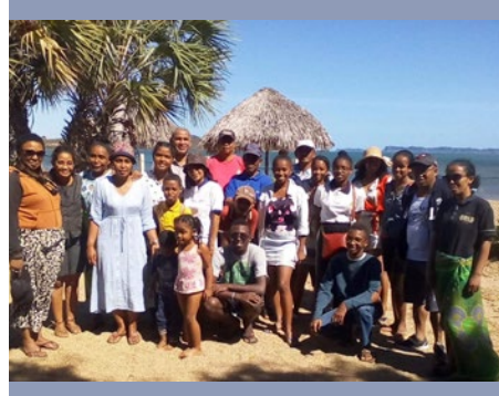
MADAGASCAR: LAY PEOPLE AND MARIST YOUTH IN ANTISRANANA