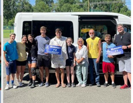
UNITED STATES: MARIST YOUTH USA