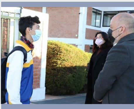
CHILE: COLEGIO MARISTA LAS COMPAÑÍAS – N. SRA. ANDACOLLO