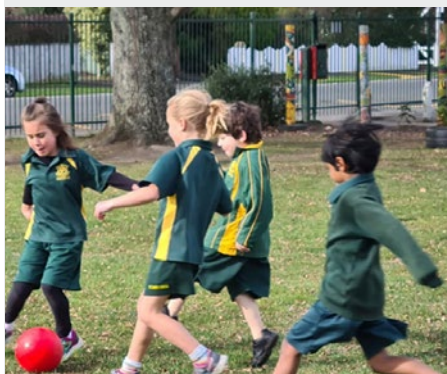
NEW ZEALAND: ST PETER'S COLLEGE, PALMERSTON NORTH