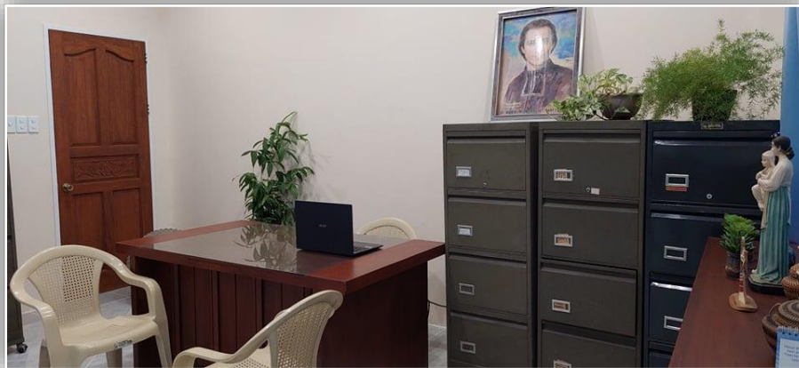
Brother Provincial's Office