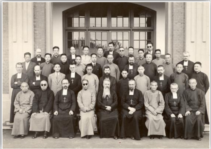
SHANGHAI, CHINA – TEACHING STAFF OF THE FRANCO-CHINA – MUNICIPAL SCHOOL – 1938

The fact was that the political situation was far from being at its best. There was unrest, civil war, strikes, as well as anti-European and anti-Christian tensions. The Republic was only such in name; the reality was that there was arbitrary rule based on military strength, and warlordism was becoming evident. The Communist Party of China (CPC), which was founded in 1921, then joined forces with the Kuomintang (KMT) or Chinese Nationalist Party in 1923 to combat warlordism at the local front as the First United Front. But after the death of Sun Yat-sen in 1925, tensions began to rise between the Communist Party and right wing of the KMT. Chiang Kai-shek, the new commander-in-chief of the KMT, moved to eliminate the Communists from areas in his control. The left wing of the KMT continued supporting the Communists for a time, until friction developed between them and ended their alliance, thus bringing an official end to the first United Front in 1927.