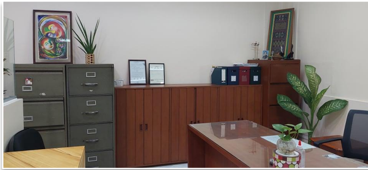
Two cubicles for Office Personnel