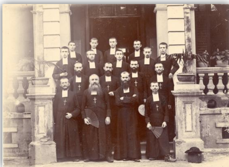
CANTON, CHINA – COMMUNITY – 1904