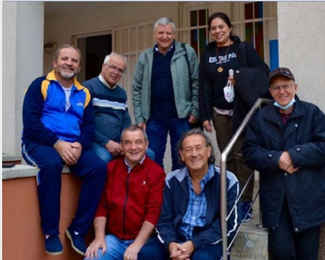
ROMANIA: MOINESTI COMMUNITY