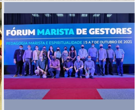
BRAZIL: FÓRUM MARISTA DE GESTORES