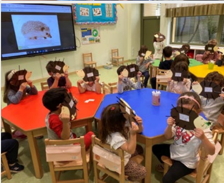
GREECE: NURSERY SCHOOL – SMYRNI