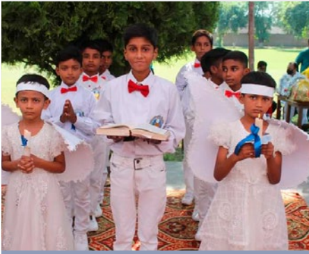
PAKISTAN: SARGODHA CATHOLIC HIGH SCHOOL – 1ST HOLY COMMUNION