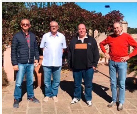
ITALY: MEETING OF THE FRATELLI PROJECT COUNCIL IN MANZIANA