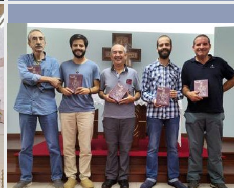
PORTUGAL: COMMUNITIES RECEIVE THE CONSTITUTIONS AND THE RULE OF LIFE