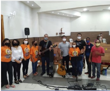
BRAZIL: FRATERNITY NOSSA SENHORA DA CONCEIÇÃO DE BALSAS, MÁ