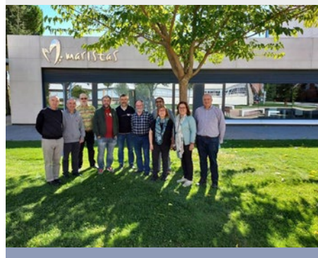
SPAIN: EUROPEAN TEAMS OF BROTHERS TODAY AND MARIST LAITY