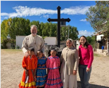
MEXICO: COMMUNITY OF THE SIERRA TARAHUMARA