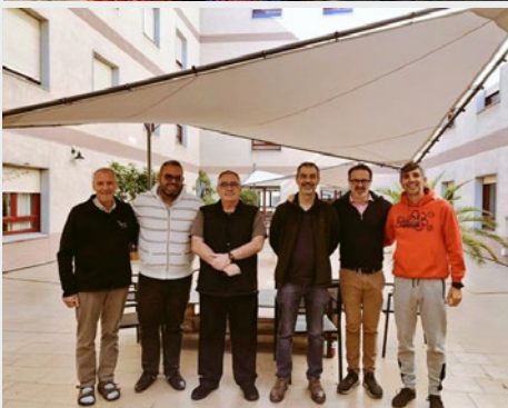
SPAIN: EUROPEAN COUNCIL OF MISSION