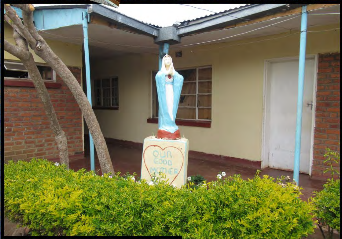
OUR LADY OF CHAMPAGNAT HOUSE.