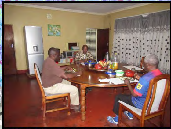
Fomators at table.