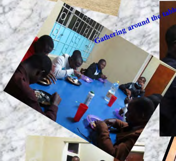
Gathering around the table