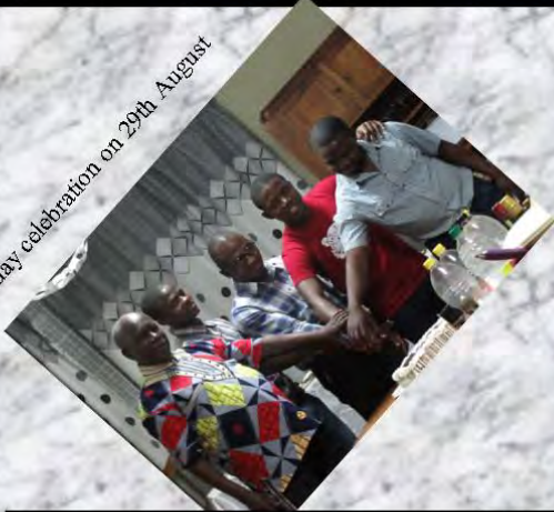
Birthday celebration on 29th August