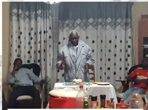
Brother sharing his experience as a Marist.