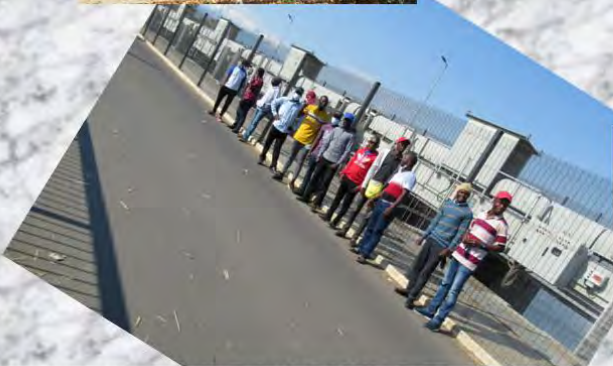
AT KAMUZU BRIDGE; ON OUR WAY TO THE NATIONAL PARK.