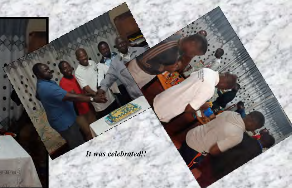
It was celebrated!!