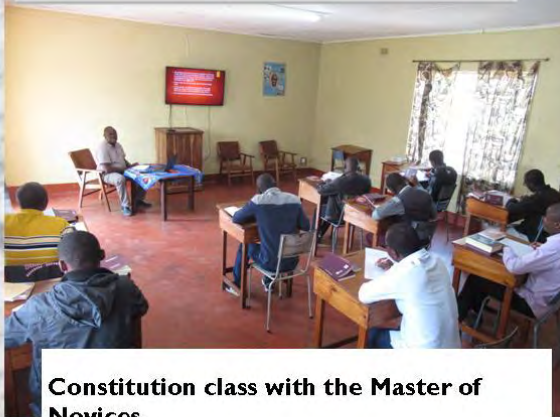
Constitution class with the Master of Novices.