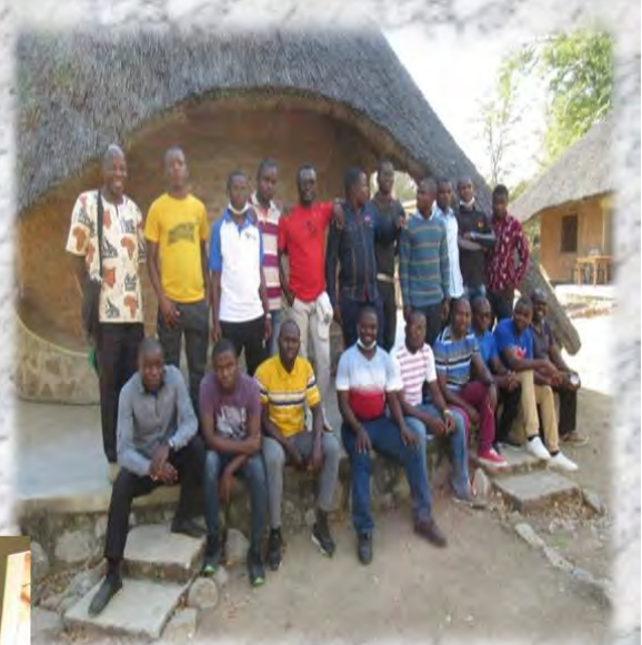
A group photo after moving around the park.