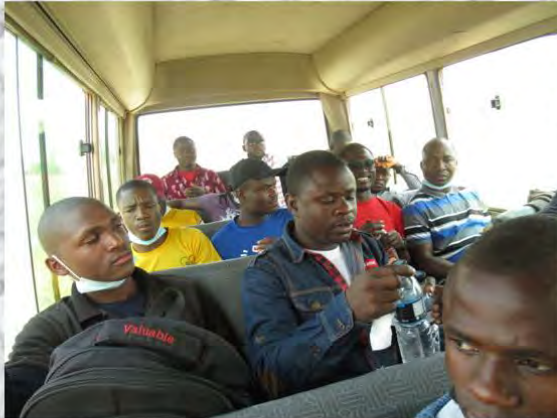
In the bus