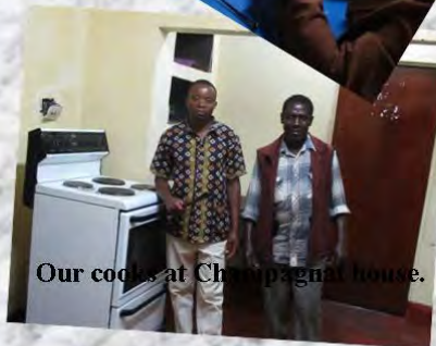
Our cooks at Chappagnat house.